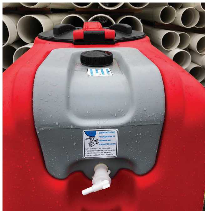
On Board Fresh Water Tank