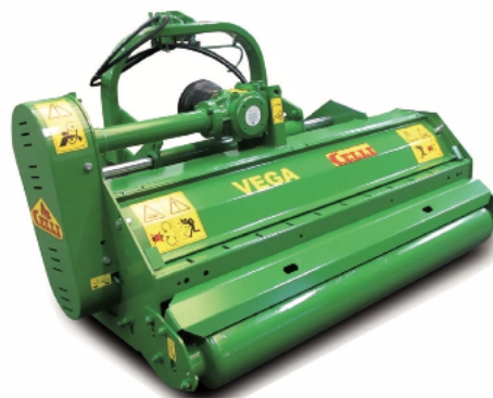
Roller is separated from side-skids

Suitable for grass, greens, set-aside (1½" Diameter)