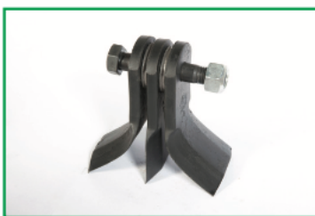
Y shaped blades with straight blade (optional)