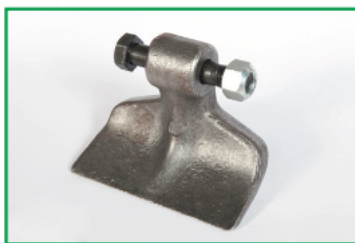
Flat hammer (standard)