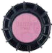
PGJ Reclaimed Available as a factory installed option on all models